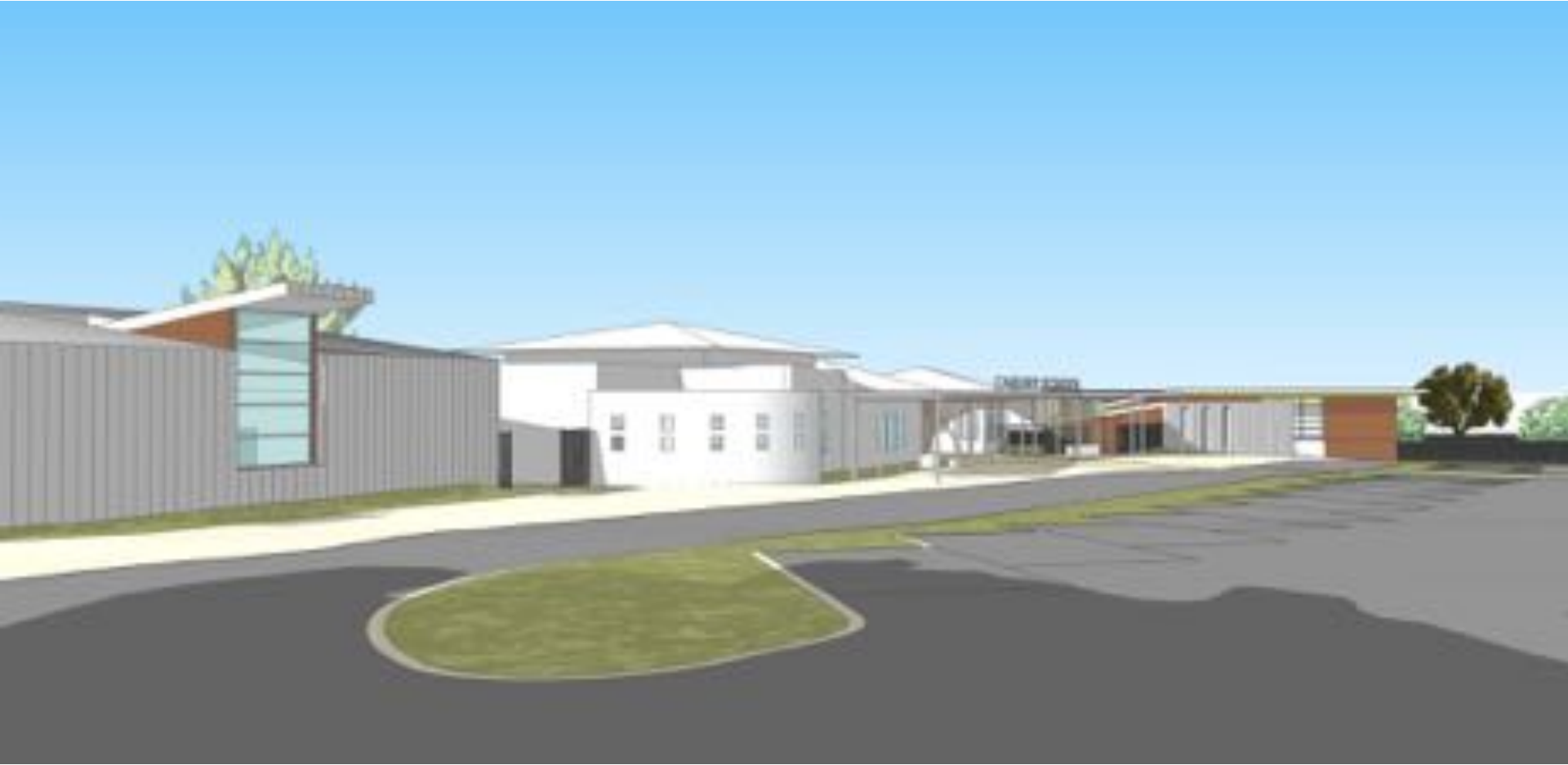
Front of School